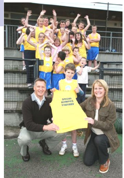
Insubond's Chairman and MD present new sports kit to local charity Special Olympics Stafford www.freewebs.com/sostafford